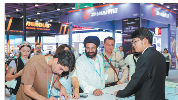
Foreign buyers check in to participate in a matching event during the expo.