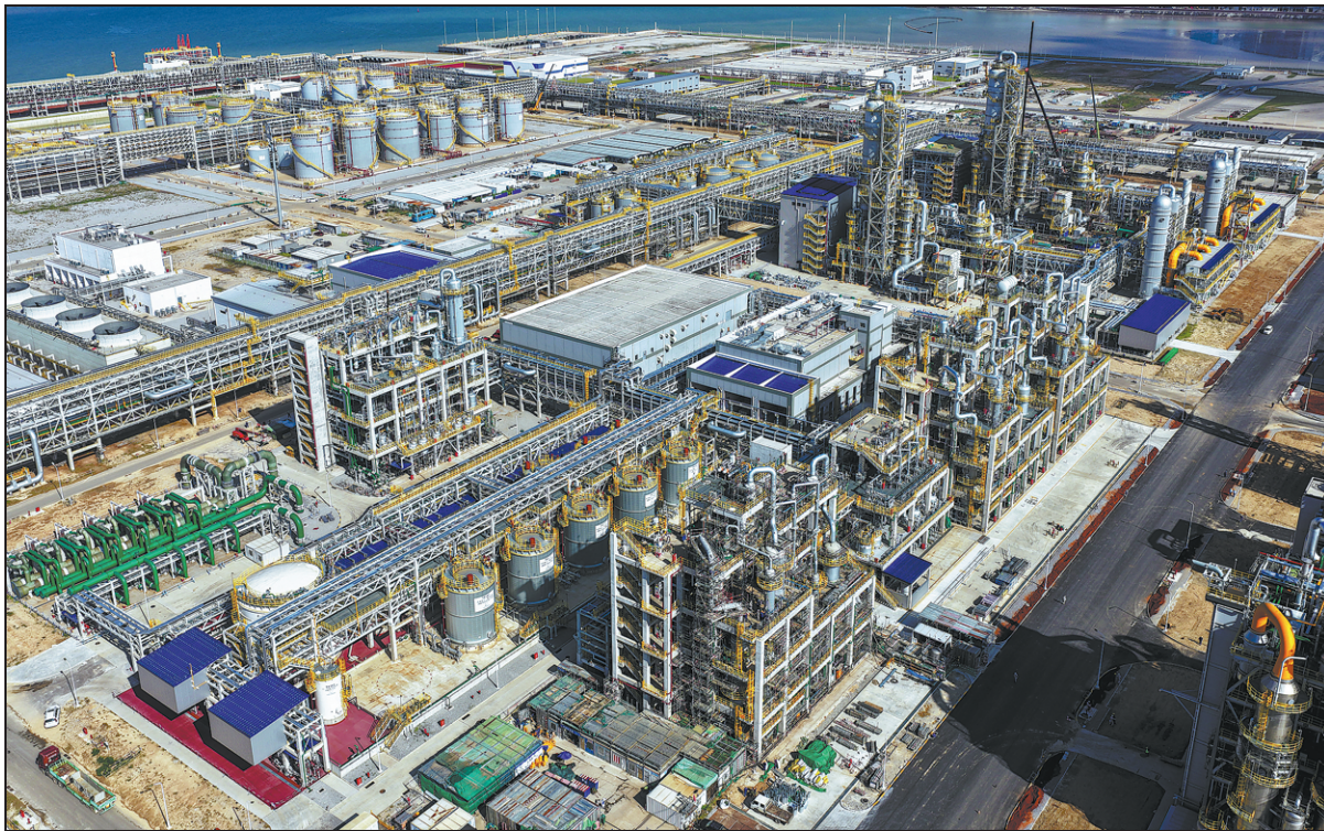
A view of BASF's new Verbund site in Zhanjiang, Guangdong province.