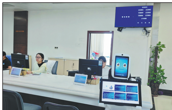
AI tools are used at an administrative service center in Zhanjiang to help residents with their affairs.