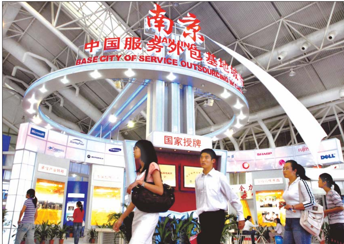
Nanjing is among the nation's leading cities for service outsourcing.

Today 486 companies with a total staff of more than 115,000